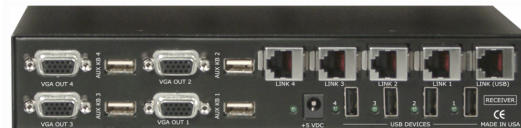
Receiver With auxiliary USB Keyboard input