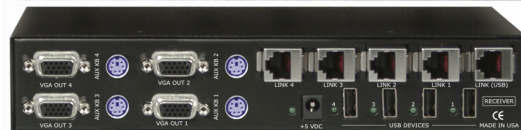
Receiver With auxiliary PS/2 Keyboard input

NOTE: Aux keyboard input (USB or PS/2) are for video adjustments only.