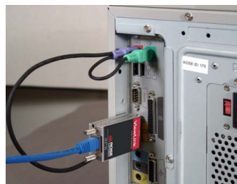
Connect the transmitter directly to a PC's Video, keyboard, and mouse ports