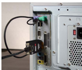
Direct connect CAT5 Transmitter streamlines your installation

As the inventors of the KVM switch, Rose continues to provide leading solutions for your server management needs. With headquarters in the US and offices in Europe and Asia, Rose provides a full range of capabilities and support. Call us today for more information about this and other Rose products.